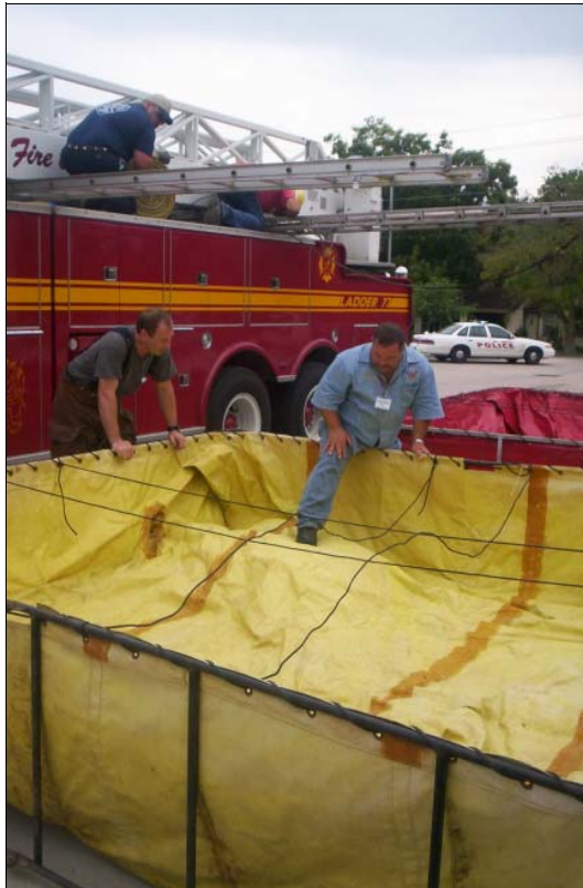
The Sweeny and Old Ocean Volunteer Fire Departments set up decontamination tanks outside the ER.